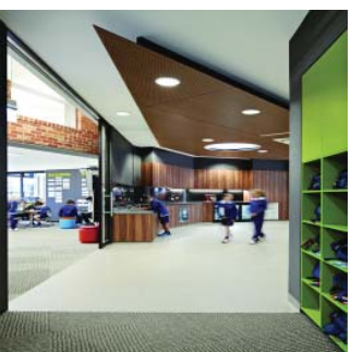
St Monica's Primary School, Middle School Project