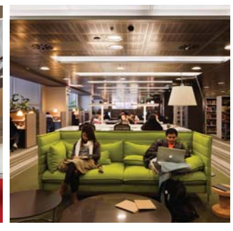
Giblin Eunson Library